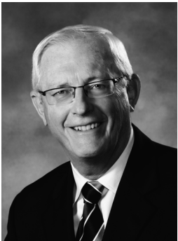
Mayor Wayne Baldwin