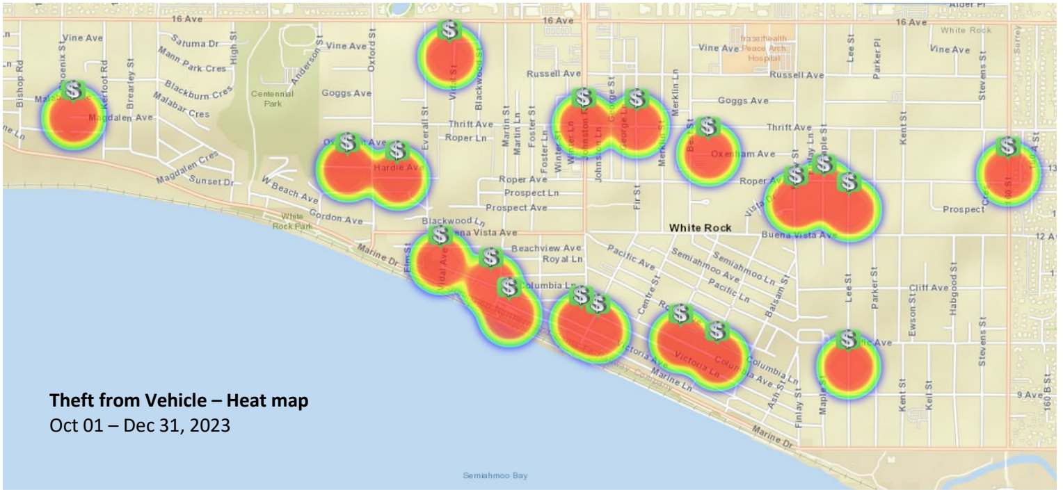
Theft from Vehicle – Heat map Oct 01 – Dec 31, 2023