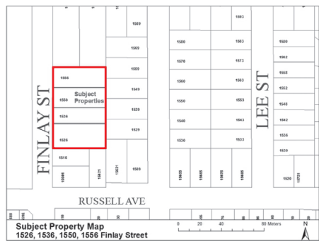
SITE MAP 1