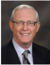
MAYOR WAYNE BALDWIN