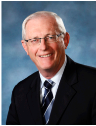
MAYOR WAYNE BALDWIN