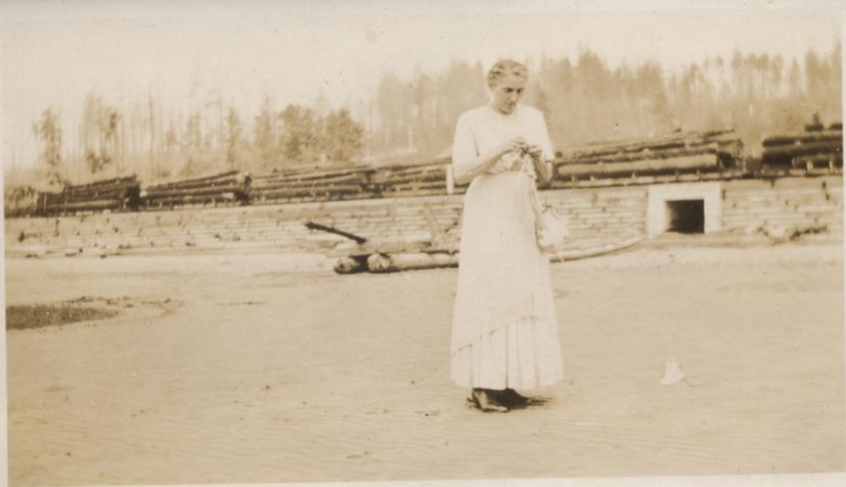
- Morning Stroll - White Rocks. -1916-