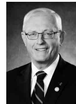
Mayor Wayne Baldwin