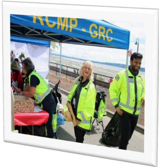
Volunteers at work in the community