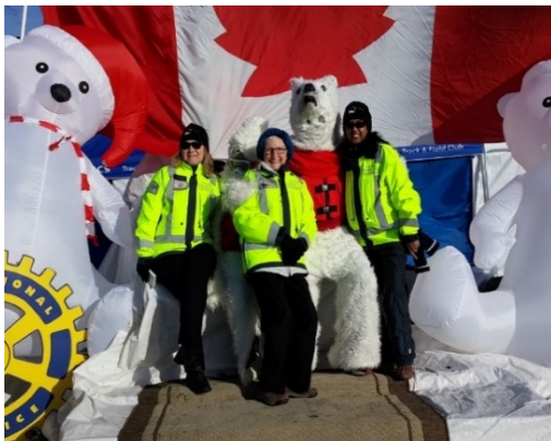
Polar Bear Swim