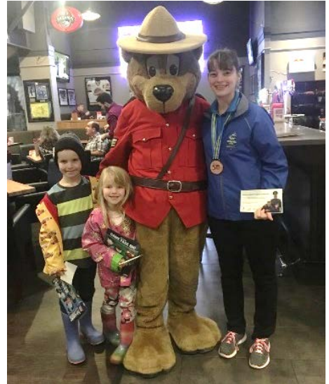
Supporting the Special Olympics Fundraiser