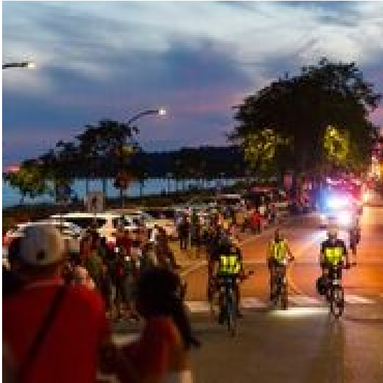
Leading the Torch Light Parade

“Every dollar we spend on crime prevention saves $16 in enforcement.” (RCMP Mounted Police Foundation)