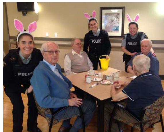
Visiting Senior Homes at Easter