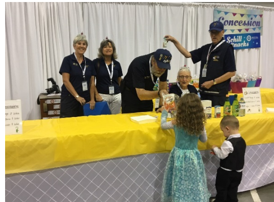
Princess Party Fund Raiser