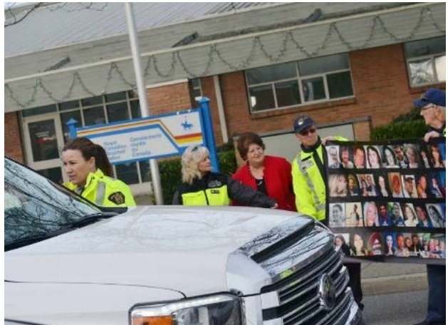
Impaired Drivers Awareness Campaign