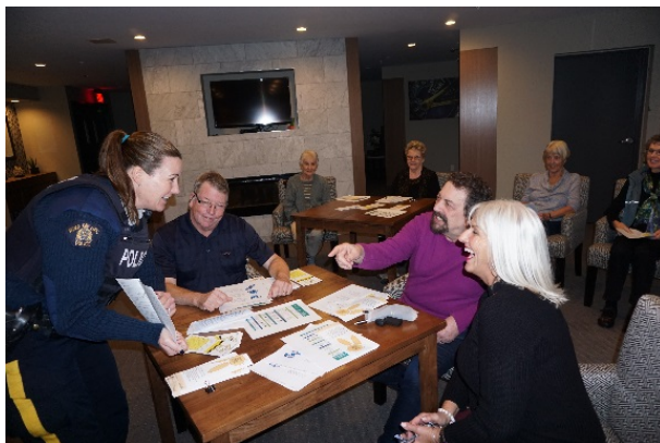
Block Watch Training

Volunteers were involved in many Community and City Events acting as extra eyes and ears for the police as well as providing interactive activities for the public designed to teach safety and build positive police-public relationships: