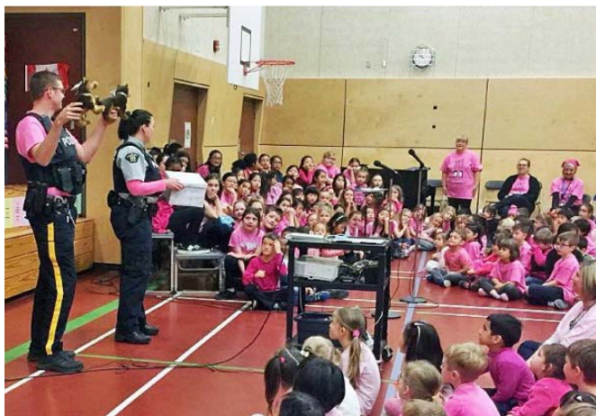
Pink Shirt Anti-Bullying Day