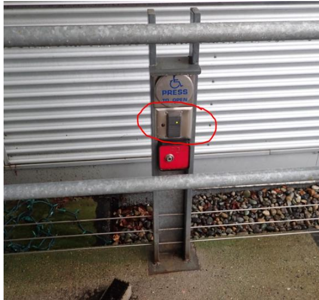
Sample swipe card reader circled above.

Answer: Card readers are exterior card readers similar to those being used at city sites. The card readers will be mounted by NexGen Technologies.