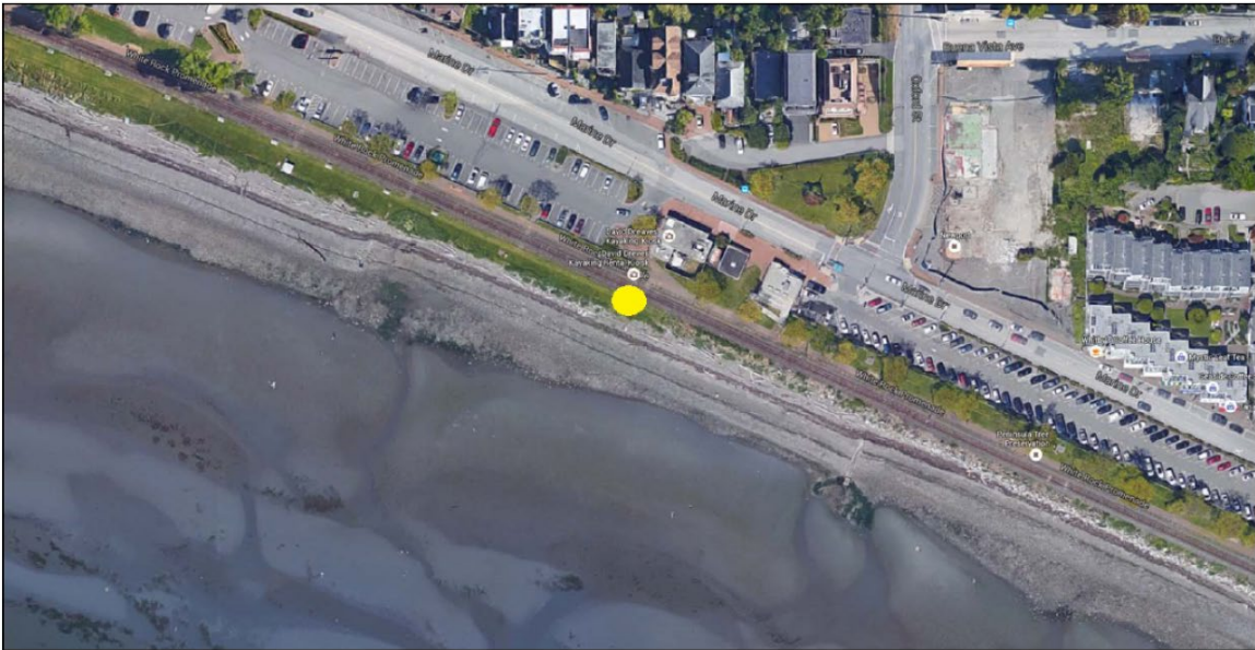
Stand up Paddleboard and Kayak Rental Locations West Beach location 2