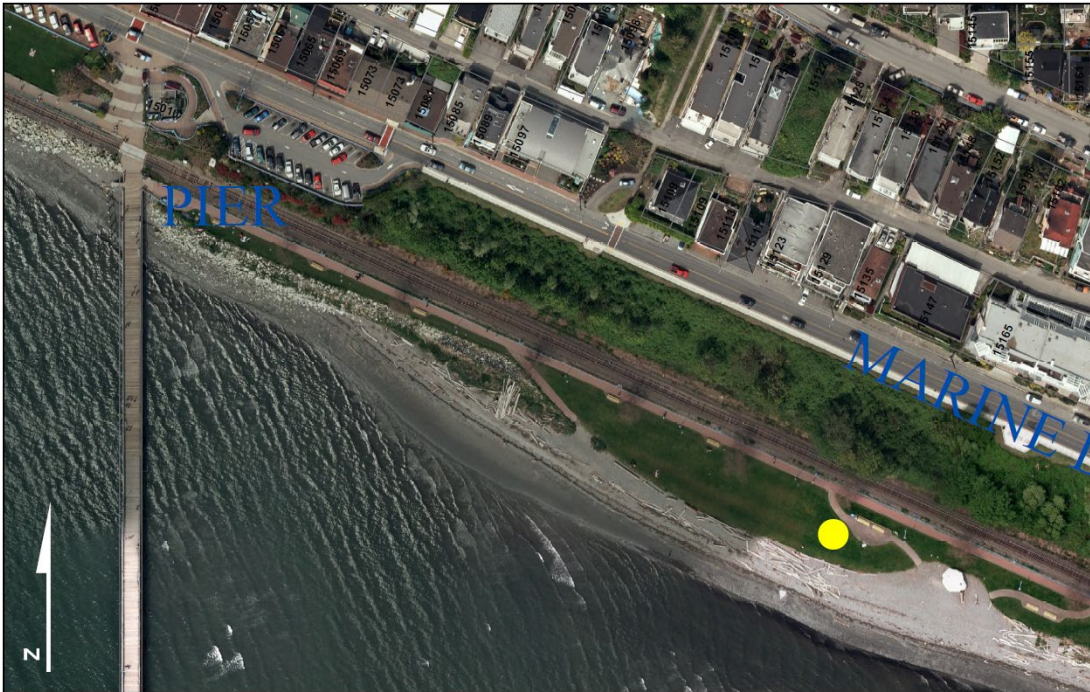
Stand up Paddleboard and Kayak Rental Locations East Beach location 1