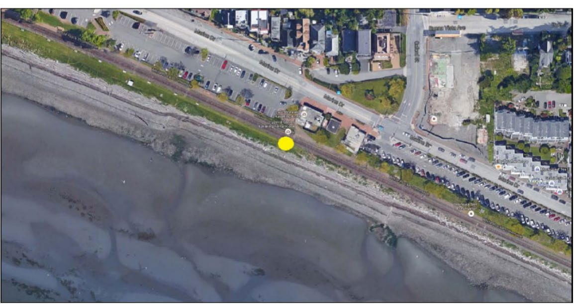
Stand up Paddleboard and Kayak Rental Locations West Beach location 2